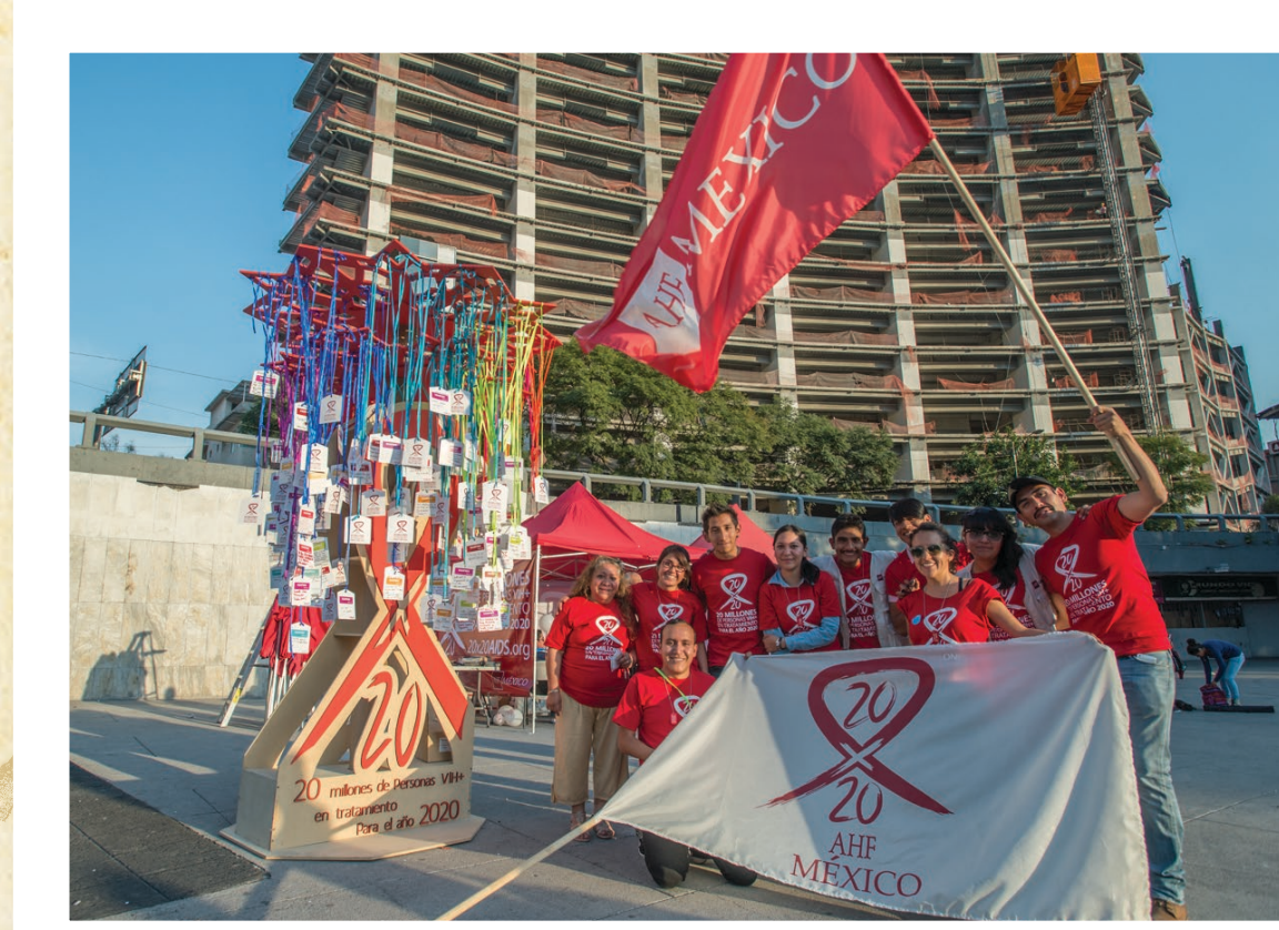
Mexico celebrating World AIDS Day with 20x20 motivation