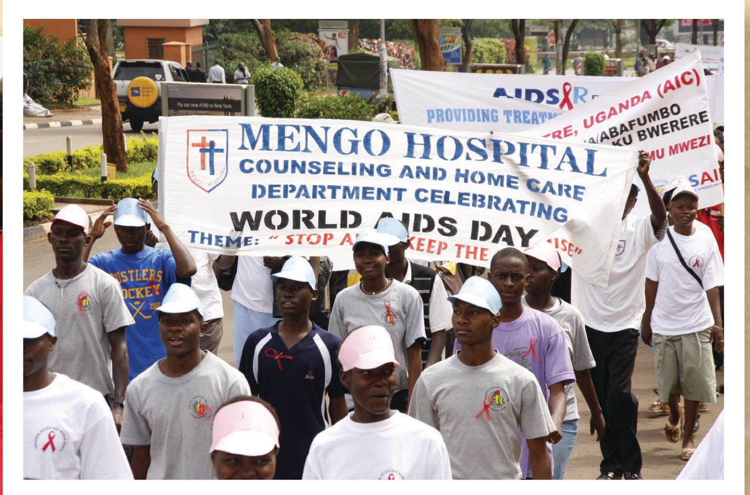
Testing Millions by AHF Kenya, World AIDS Day Event 2009