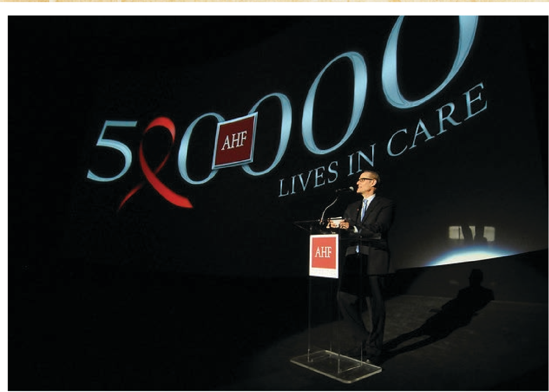
Michael Weinstein at World AIDS Day AHF celebration of 500,000 lives in care in 2015