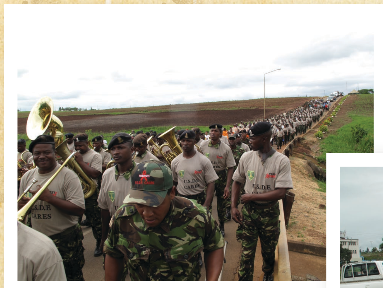
World AIDS Day 2010 Uganda with Military participating in parade