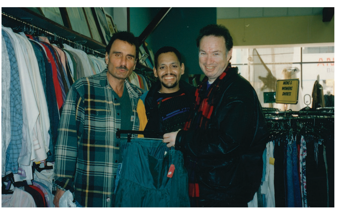
World AIDS Day 1997 - Out of the Closet Donation events, encouraging donations and advertising special promotion