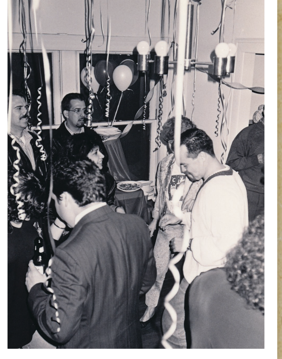
World AIDS Day 1994 - A Day Without Art at the Chris Brownlie Hospice